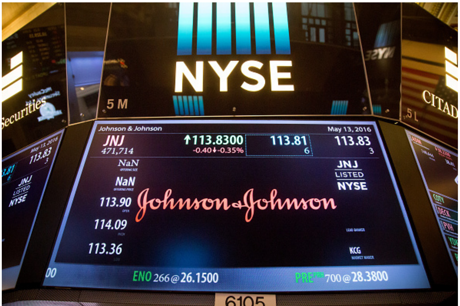
Johnson & Johnson signage is displayed on a monitor on the floor of the New York Stock Exchange (NYSE) in New York, on May 13, 2016.