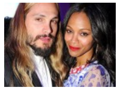
30 Interracial Celeb Couples You Probably Had No Idea Existed