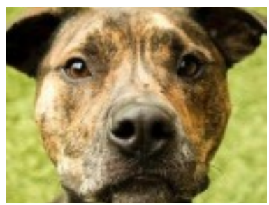
Man's Emotional Reunion With Dog Goes Viral